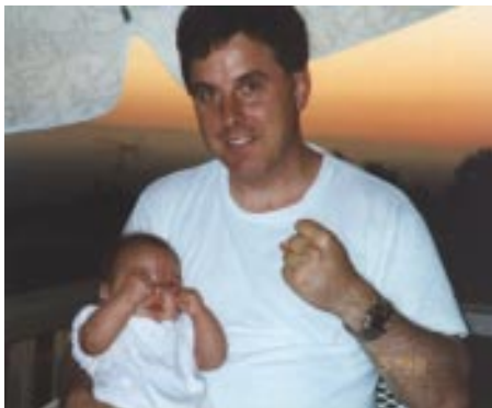
Emily is ready for a fight. "I'm not scared of you, ya big bully!"