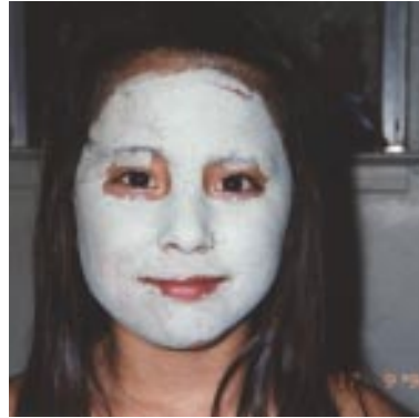
Mommy has a permanent volunteer when she needs to test a new NuSkin product!