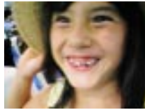
And here she is a few months later with a couple of big teeth appearing.